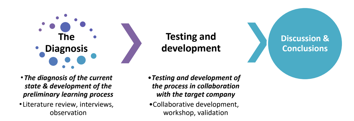
Figure 2. The structure of the design science research

Second, in the testing and development phase, the process is tested and further developed through collaboration with the target company's personnel, including the preparation, testing in workshop, and analysis of the tested process. Third, in the discussion and conclusion phase, authors address whenever the research question was answered properly, and attempt to provide avenues for future research.