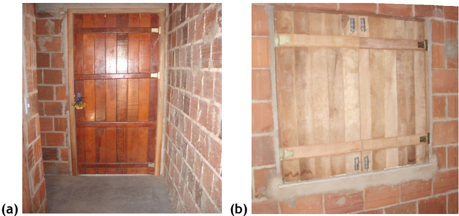
Figure 1: (a) Batten door used in PS1; (b) Window used in PS1

The wooden windows and doors supplied to PS1 were provided by a company that used to acquire materials from other suppliers and resell them to construction companies in Fortaleza. The supplier would buy the wooden elements from other regions of Brazil and transport them to a yard in Fortaleza, from there the material used to be distributed to construction projects. The construction company had a list with contacts for nine different suppliers for this project. At the time of the study 3 different suppliers had been used. The products used to be inspected upon delivery and characteristics such as height, width, and plumb were checked for windows and doors.