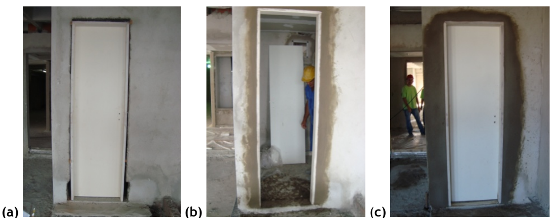
Figure 2: (a) Door frame permanently fixed; (b) Door is removed and frame remains fixed; (c) After the voids are filled with mortar the door is installed again.

The lead time to complete the installation of 160 doors was 32 days. One day after the first batch of 40 doors arrived at the site, the supplier's workers in charge of the installation met with the quality manager, the safety manager, and the project's foreman and equally distributed the batch in four floors. The installation process started the following day on the first floor, which was a model (prototype) for the services, and then proceed from the upper-most floor down.